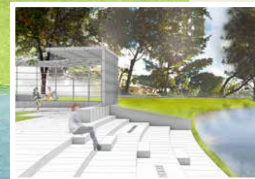
Lake amphitheater seating - View looking south from lake amphitheater seating with south trellis in view