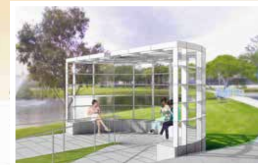
Entry trellis pavilion - View looking northwest with SIPA building beyond, featuring custom pavers, rounded bench, and overhead shade structure